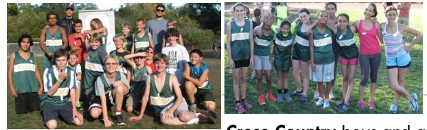
Cross-Country boys and girls